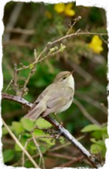
A Willow Warbler

Birds can travel huge distances when they migrate. Some birds leave Britain to fly to countries in Africa, south of the Sahara desert. Others come from breeding grounds as far away as the Arctic. Perhaps the most well know of these is the Arctic Tern which breeds in the Arctic in the Northern Hemisphere and then migrates to the other side of the world to the Antarctic. The trip there and back is about 40,000 km!