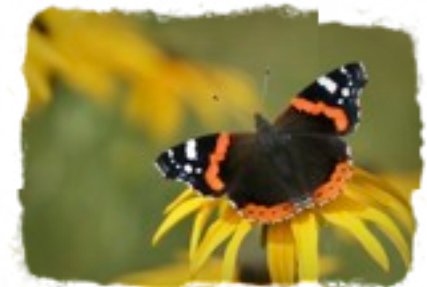
A Red Admiral

Swallows (see above) and swifts were also thought to hibernate in caves when actually they can fly over 6,000 miles!